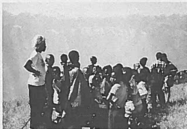
Children at Victoria Falls, Zambia

In Madagascar, one of the main issues is malnutrition in spite of the overall production being above the Food and Agricultural Organization (FAO) standards of 2100 calories per capita per day. The paradox of high malnutrition persisting in a situation of more than adequate food availability is explained partly by the inefficient use of available foods. But the primary explanation seems to come from the analysis of distribution issues, i.e. entitlement framework. Large discrepancy exists between male and female-headed households.