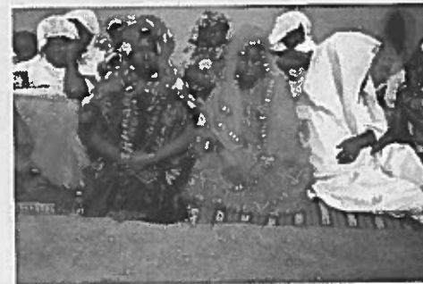
Girls in Guinea.

Part of the problem is that the girls' education is often interrupted because of insufficient classroom space. This is why building the school was an exciting project for me.