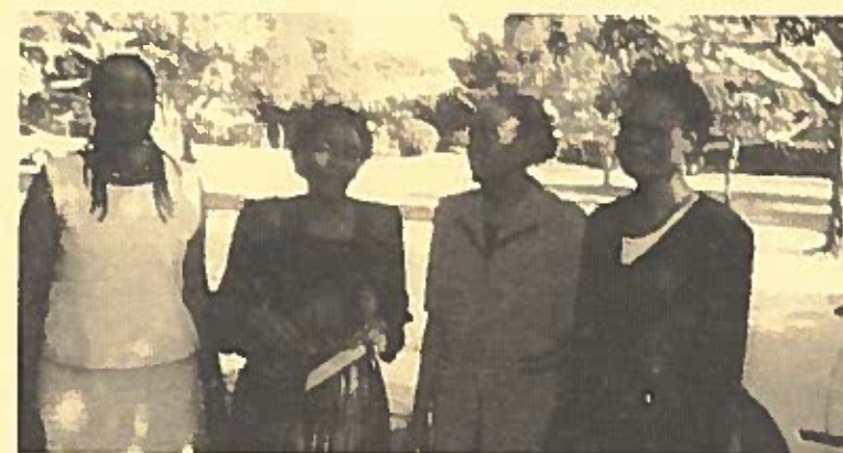
Staff of the History Department, Kenyatta University