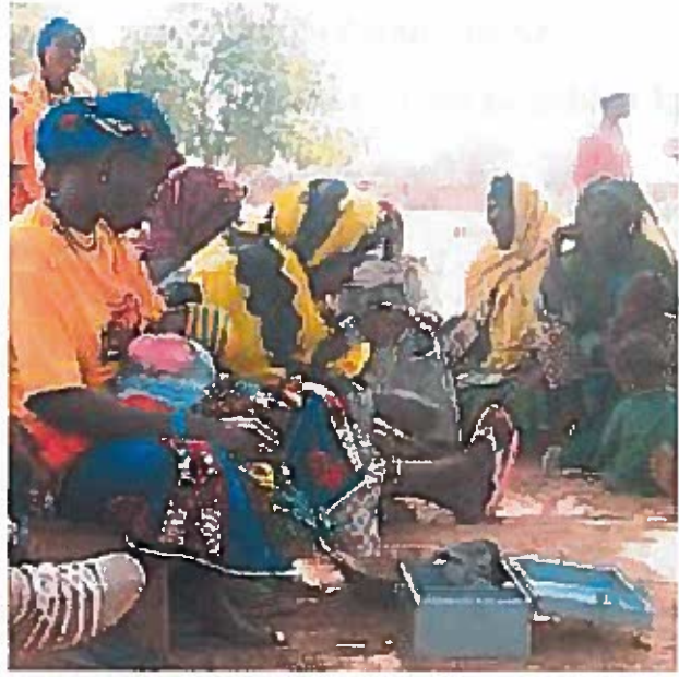
President of women's microcredit group counting money saved during weekly meeting, Burkina Faso

programs in rural areas. We then traveled to rural areas and visited dry season farms with irrigation systems and microcredit groups. Men, women and children work on several hectares of land growing cabbage, maize, tomatoes and beans to ship to other parts of West Africa. Cotton is the main export, but we only saw men engaged in this type of work. Whereas in South Africa, individuals were borrowing large sums from the bank, in Burkina Faso we visited new savings and loan cooperatives in villages, where women save approximately $.20 a week together to be loaned out in the future. This money was earned by selling boiled peanuts in the village or to tourists. Even when earning a small amount, these women were able to save a little every week.