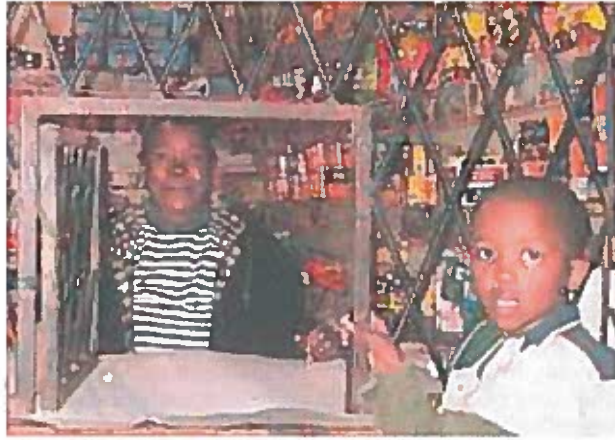
Woman running a shop out of her garage near Pietermaritzburg, South Africa

Natal, I met women who would use savings and loans from the bank to expand their businesses, which were often connected to their domestic tasks. Many women worked as domestic workers, dress-makers, and shop owners/petty traders. Another occupation for women