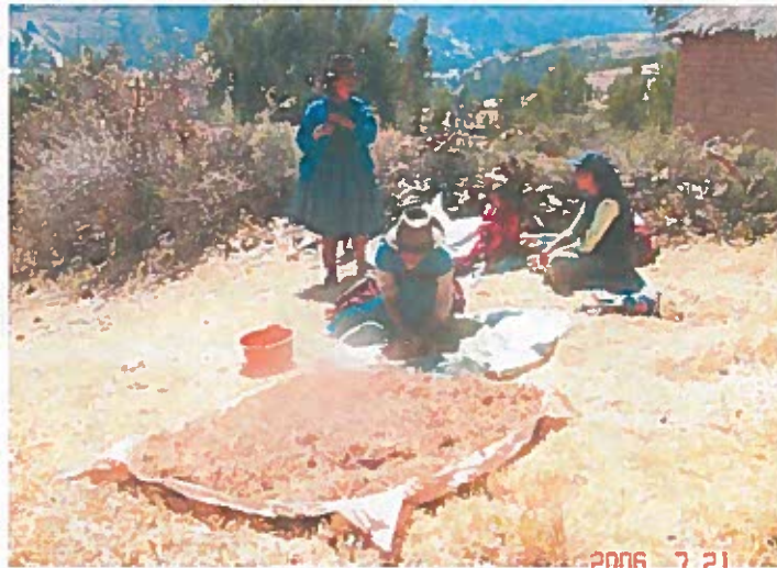
Chari women on their daily routine: weaving, looking after animals, and selecting Quinoa cereal for that day’s meal

self-esteem, child rearing, and family violence as part of their strategy.