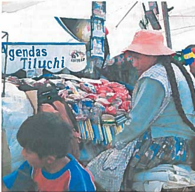
Woman selling clothes in fixed stall

it is claimed, would solve many of the aspects of gender inequity espoused by the old social hierarchy. Market women are playing and will continue to play a role in the transition to a new Bolivian nationalism. Precisely how this role will be able to influence this shift and the construction of Bolivia's emerging national identity for both men and women and for the indigenous and non-indigenous, remains to be seen.