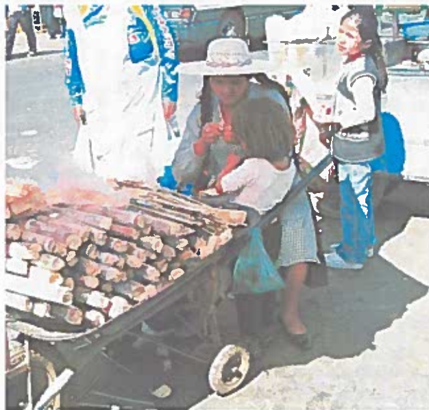
Woman and children selling sugar cane in moveable cart

In the past, market women used to negotiate