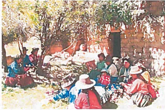
Chari women’s weaving association sharing stories during lunch time

• NGO’s that are present in the community have the goal of helping community members find new ways for economic advancement and to strengthen the skills that members of the community have already acquired (such as knitting). However, it was interesting to see that these organizations are including workshops on