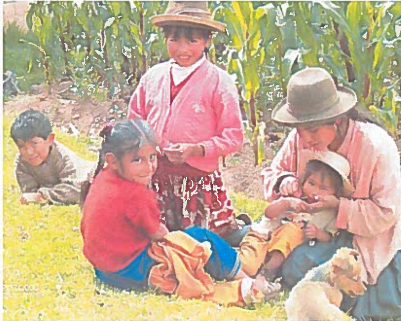
Woman and children from Chari

•Women included violence exerted by family