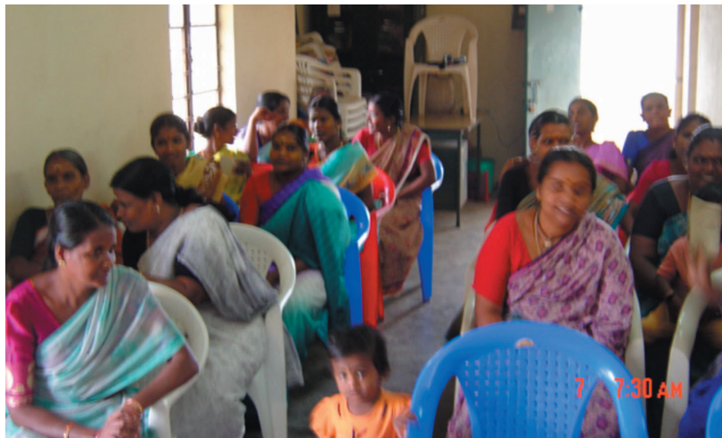
Women's class in Marketplace Literacy Project