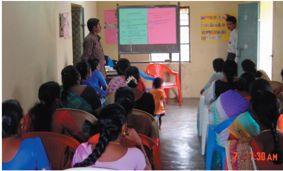
Marketplace Literacy Project in India

practice has focused on market access and financial resources (e.g., microlending), two important elements that enable impoverished individuals to participate in the marketplace. We focus on a third important element that has not been emphasized in research and practice - marketplace know-how, through an educational program