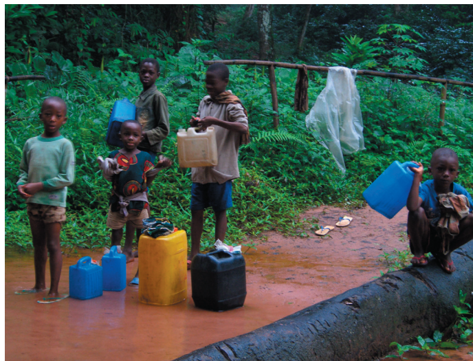
Children collect water from the stream

The first task of the water project was to choose the source of water that will meet the village's needs. The team studied the possibility of a water