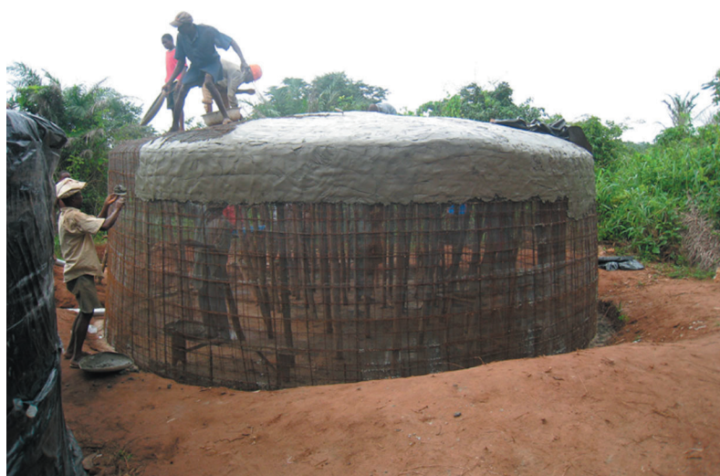
Cement work on ferrocement tank