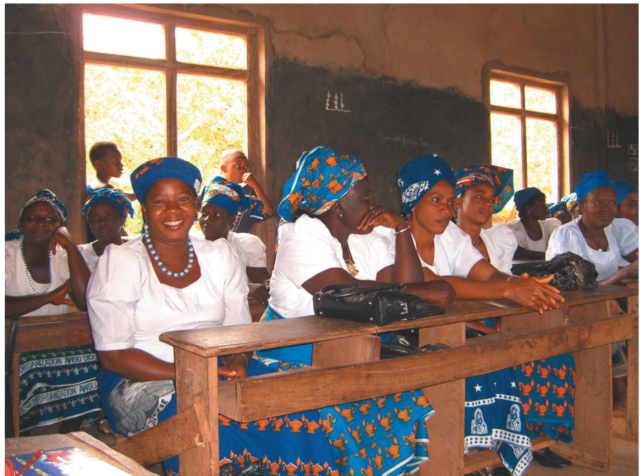
Health meeting with local women's group

The students are planning to return to the village in the coming months to finish the water distribution system and continue to work with the local women and NGOs to study and improve health.