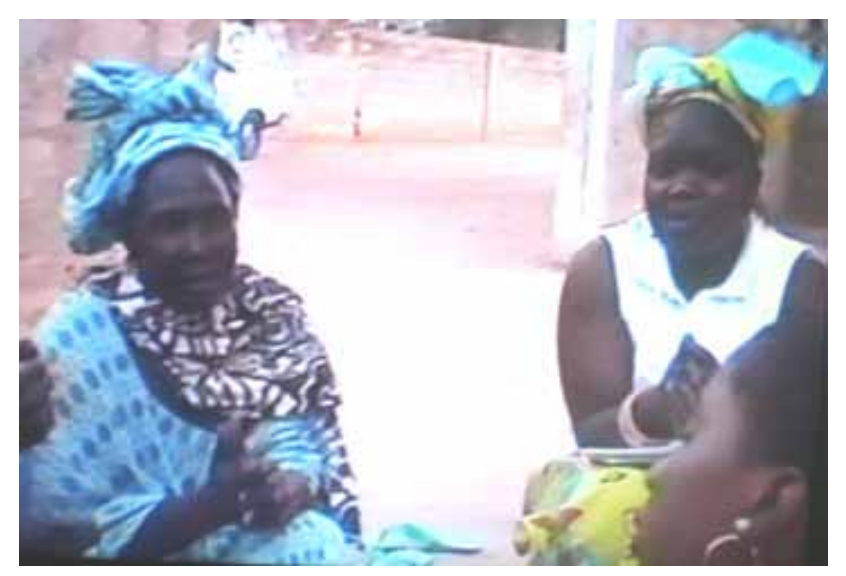
Sometimes the women would break into singing.

and training constituted a vital element in the overall strategy for sustainable development. Such initiatives were particularly important in developing countries -especially in South East Asia and Sub-Saharan Africa. The same period also witnessed an increased visibility of NGOs and a heightened recognition of their role in providing services in both formal and informal education for women. It is within this context of continued national and international efforts to bring about educational change that the Tostan program took shape, continues to evolve, and became a model for non-formal education in national languages in Senegal and several other countries in the West African sub-region and in parts of East Africa.