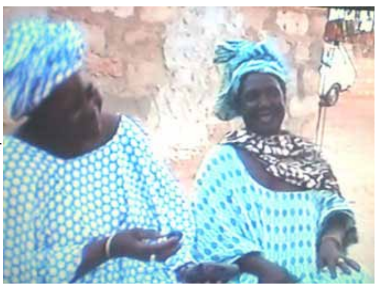
Collective story-telling during focus group interviews in Sengal.

In my current research, I take the issue of language and cultural identity further and beyond Senegal and across West Africa to explore the importance of cross-border languages and their role in the process of regional integration