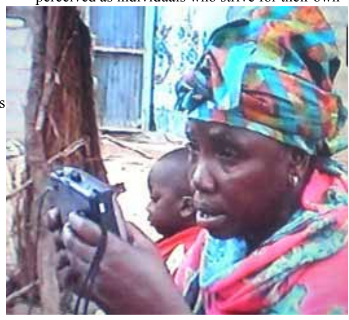
A Senegal woman records her story.

To some extent, rural women in this study are perceived as individuals who strive for their own