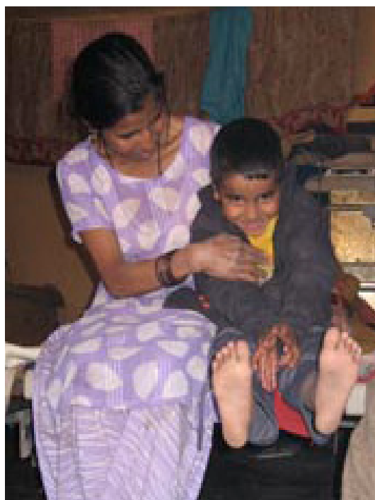
Mother and child in their one-room dwelling. Uttarakhand is a poor state.

This state of isolation and ignorance and the constricting social norm restricts women to the narrow sphere of family and housework. However, a government program called Mahila Samakhya organizes women into networks that are more diverse, stronger, and larger than they would be otherwise. My preliminary findings show that improved access to peers and the changed composition of these networks significantly increase female empowerment.