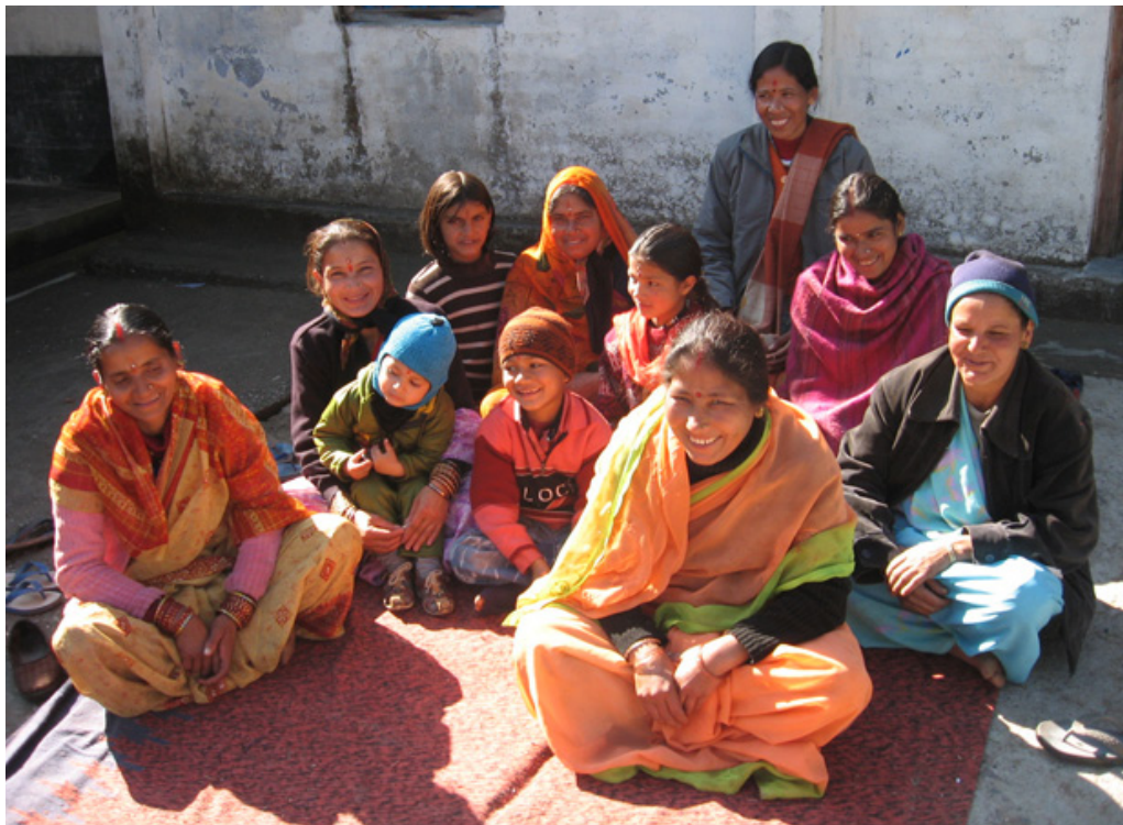
Women of Nainital, meeting to discuss the benefits of the Mahila Samakhya program.

also suggests voting patterns influence national-level budget allocation, which might hamper the effectiveness of ICDS.