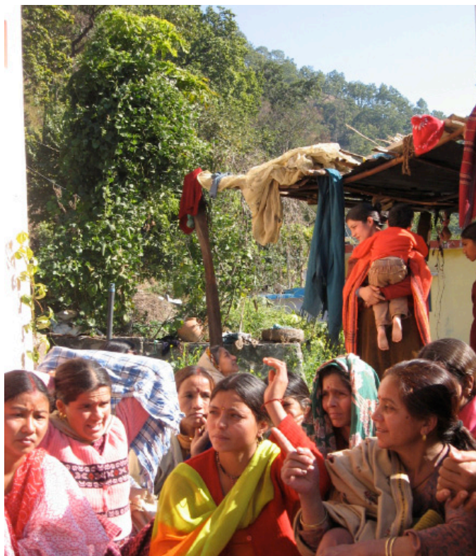
Women of Pauri, at an informational meeting led by the Mahila Samakhya program.

The data I collect are from the Himalayan state of Uttarakhand. Villages tend to be remote and lack access to many basic infrastructural facilities like government schools and hospitals. Uttarakhandi women are generally not well-educated and have very low mobility. The remoteness of the region and lack of good roads combined with stringent social norms mean that once married, women are unable to visit friends or even parents regularly.