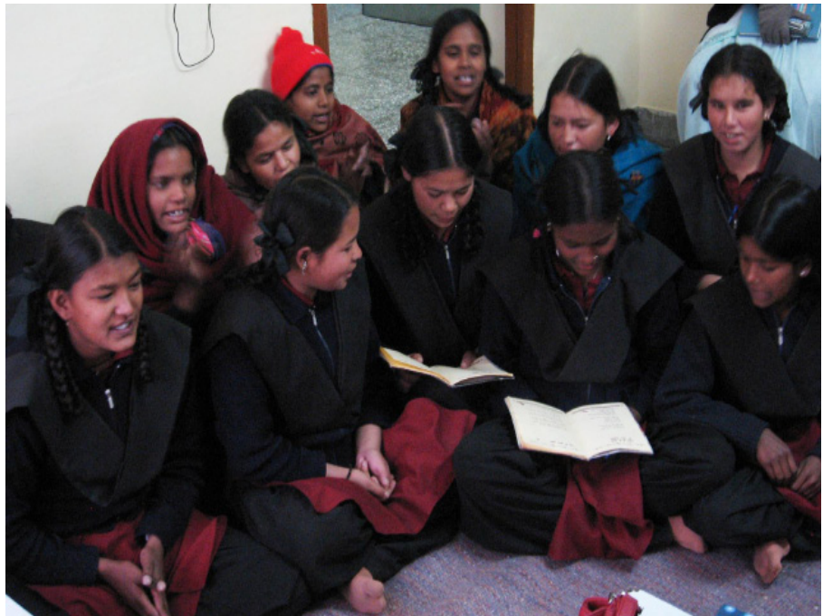
Girls at a residential educational facility in Kotdwar run by the Mahila Samakhya program. These girls would not have been able to continue their education without Mahila Samakhya, either because their parents opposed their education or because their villages have no schools, or both.

cost approximately $1.5 billion in 2008, previous evaluations failed to show its effectiveness. Recently, the World Bank recommended that the Indian government redesign the ICDS for a total price tag of $9.5 billion. The hefty price tag of redesign and the potential impact on poor households motivated my re-evaluation of the ICDS. I use new data to re-evaluate ICDS on several dimensions; in contrast to previous studies, I find significant treatment effects particularly for the worst-off children. Results show ICDS decreases long-run child malnutrition by about six percent. However, while ICDS effectively targets poor areas, it fails to target areas with low levels of average education or those with unbalanced sex ratios. Evidence