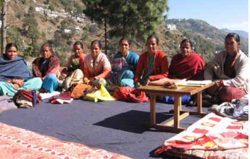
WGGP Perspectives, Vol. 31(1), Page 3

and their ability to challenge oftenrestrictive social norms. Isolated and prevented from choosing their friends, women spend their lives in the domain of the household, very much dominated by their fathers, in-laws, husbands, and often sons. In Uttarakhand, which is nestled in the Indian Himalayas, a government intervention called Mahila Samakhya aims to empower women through education. This program provides formal, informal, and