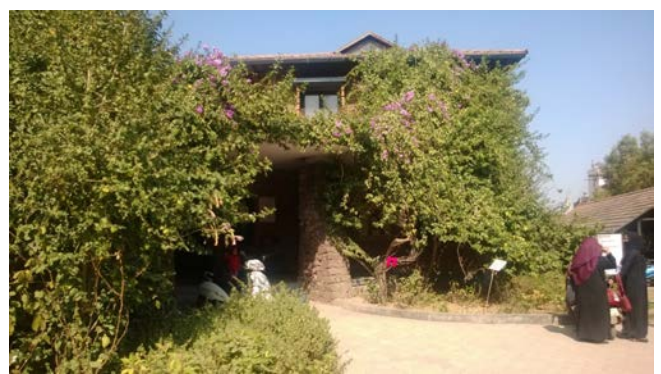
Exterior View of the Clinic

offer programs and projects beyond its everyday activities for the specific purpose of societal benefit. The designed environment while being known to influence behavior when channeled appropriately has seldom been explored as a tool in value creation, with